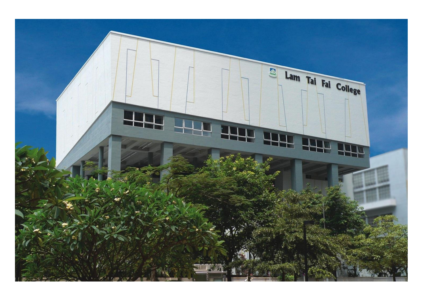
School Development Plan 2019–2022