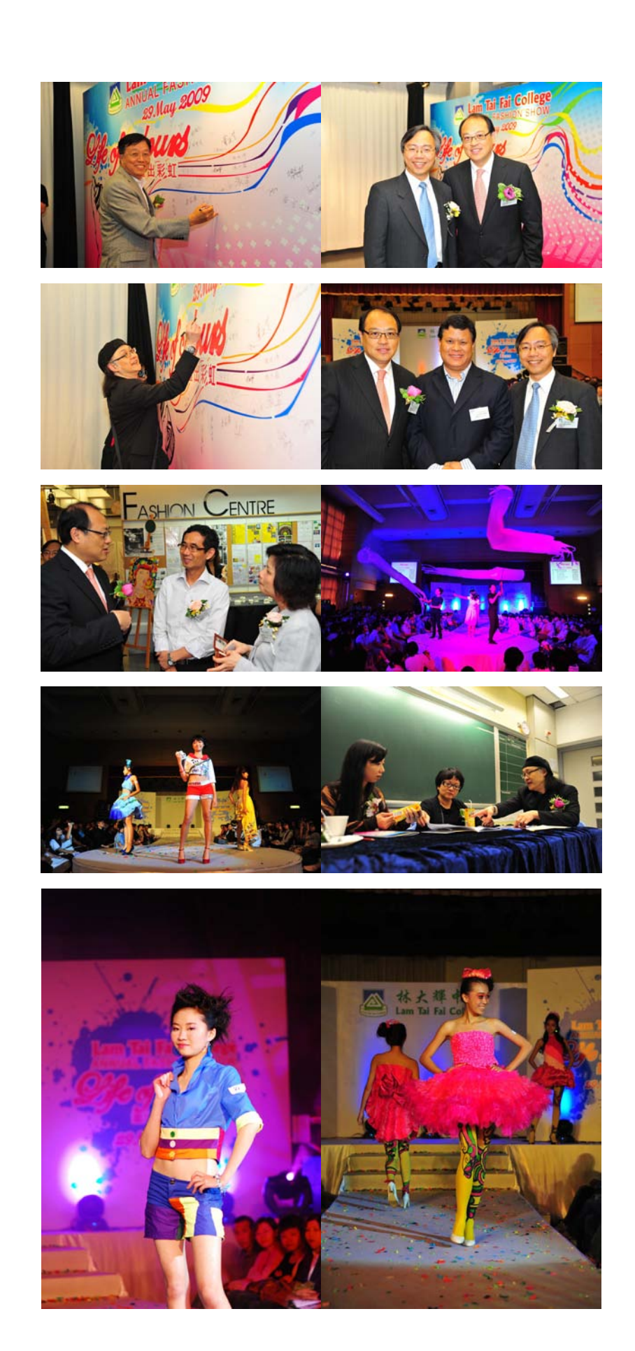
Winners of the 5th Annual Fashion Show are: